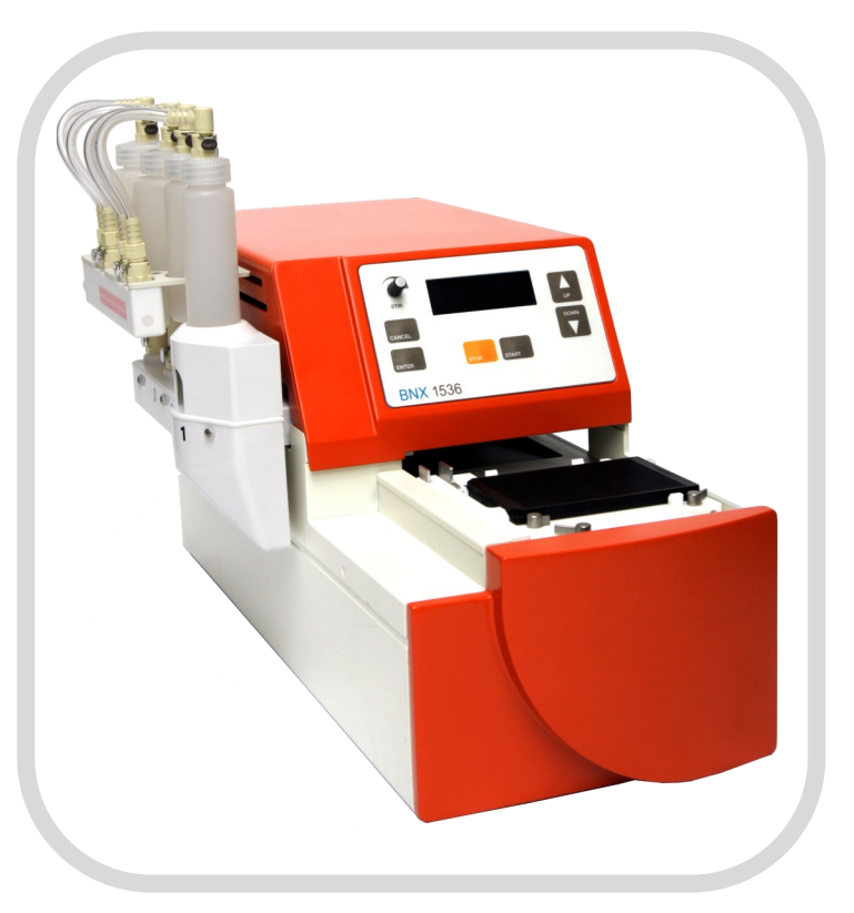
BNX 1536 Liquid Handling System

The BNX 1536 liquid handling system provides both precise dispensing and thorough microplate washing in a single instrument. The small footprint houses a built-in vacuum and air pressure pump; no external vacuum pumps are needed. Each of the four reservoir bottles has its own fluid path to individual dispense heads, allowing four different fluids to be dispensed into a single microplate. A single aspiration head allows fast and efficient