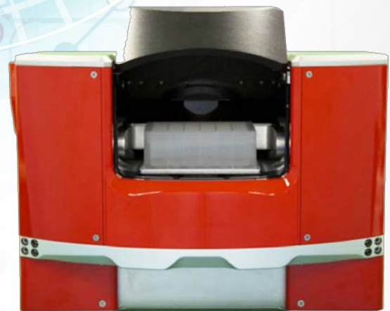
Imbalance Tolerant while maintaining Vibrational Stability

The small footprint of the HiG centrifuges easily integrates with laboratory automation, and two units can be stacked to increase throughput. The HiG is completely powered by standard electrical service, eliminating the need for compressed air or other utilities.